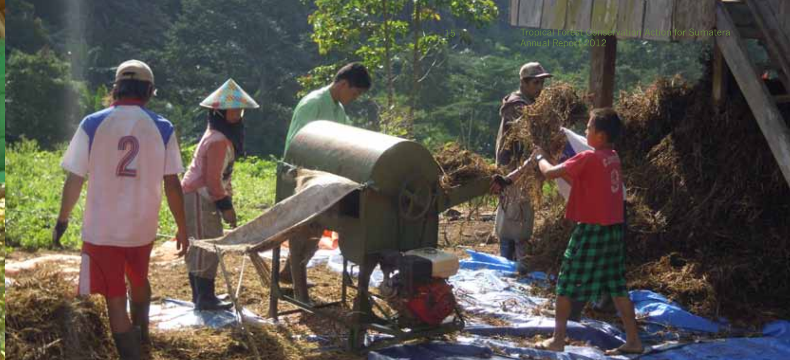
Harvest of Red bean growers in District Merangin, Jambi

AKAR has formed tiger patrol team to monitor tiger habitat in 4 districts, that is Solok Selatan, Kerinci, Merangin, Mukomuko. A proposal to establish two hutan adat (customary forest) to Head of Kerinci district has been in process.