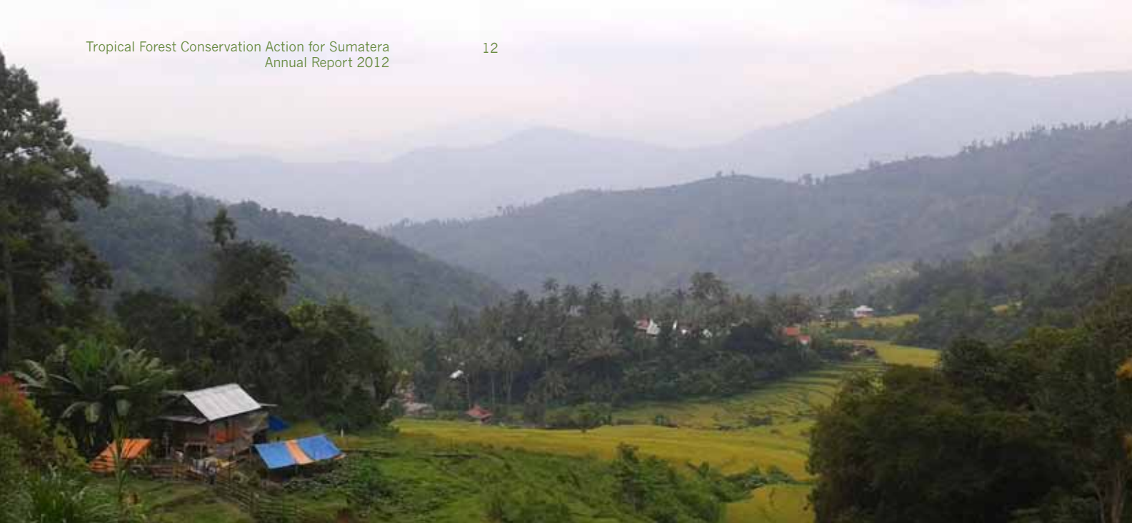
A potential tourism area in Simanau-Simancung valley, West Sumatra