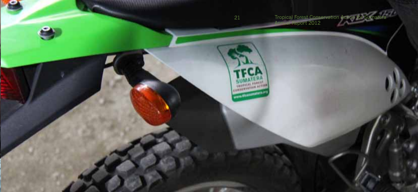
A motocross of TFCA-Sumatera inventory is used for monitoring and patrolling activity in the area. Photo taken from UNILA-PILI project in Lampung.