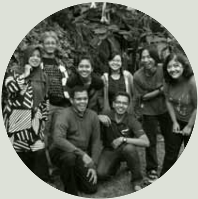
TFCA- Sumatera staff