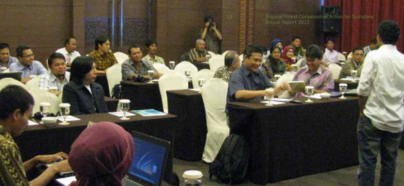
Documentation from Workshop on Conservation Initiative and Creative Economy in Bengkulu, 10-14 December 2012

To provide guidance for the local authorities and KSDA as representative of central government in Aceh to develop and manage Linge Isaq Game Reserve Area, IGA consortium has successfully develop the first draft of Management Plan for the reserve and presented to the regent of Aceh Tengah. As part of integrated conservation initiatives surrounding the reserve, the consortium has also successfully established 5 local village level cooperatives to accommodate and develop local economic potentials.