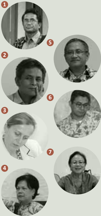
TFCA- Sumatera oversight committee