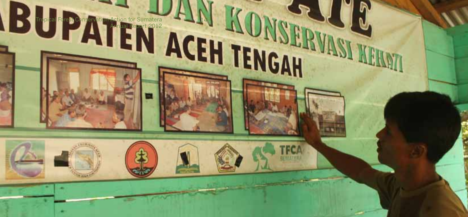
One corner contained information is displayed in a community center in Jamat village, Linge Isaq Game Forest, Central Aceh

Lau Debuk Debuk and TWA Deleng Lancuk. OIC has established four restoration centers and five nursery facilities and produced more than 90,000 seedlings where about 20 percent of them (20,350 seedlings) has been planted in 18.5 ha of critical land of Sei Betung Resort in Leuser National Park area. In addition SRI, part of OIC consortium has produced 54,500 cacao and 18,500 rubber seedlings from the field school in two villages and ready to be planted in early of 2013.