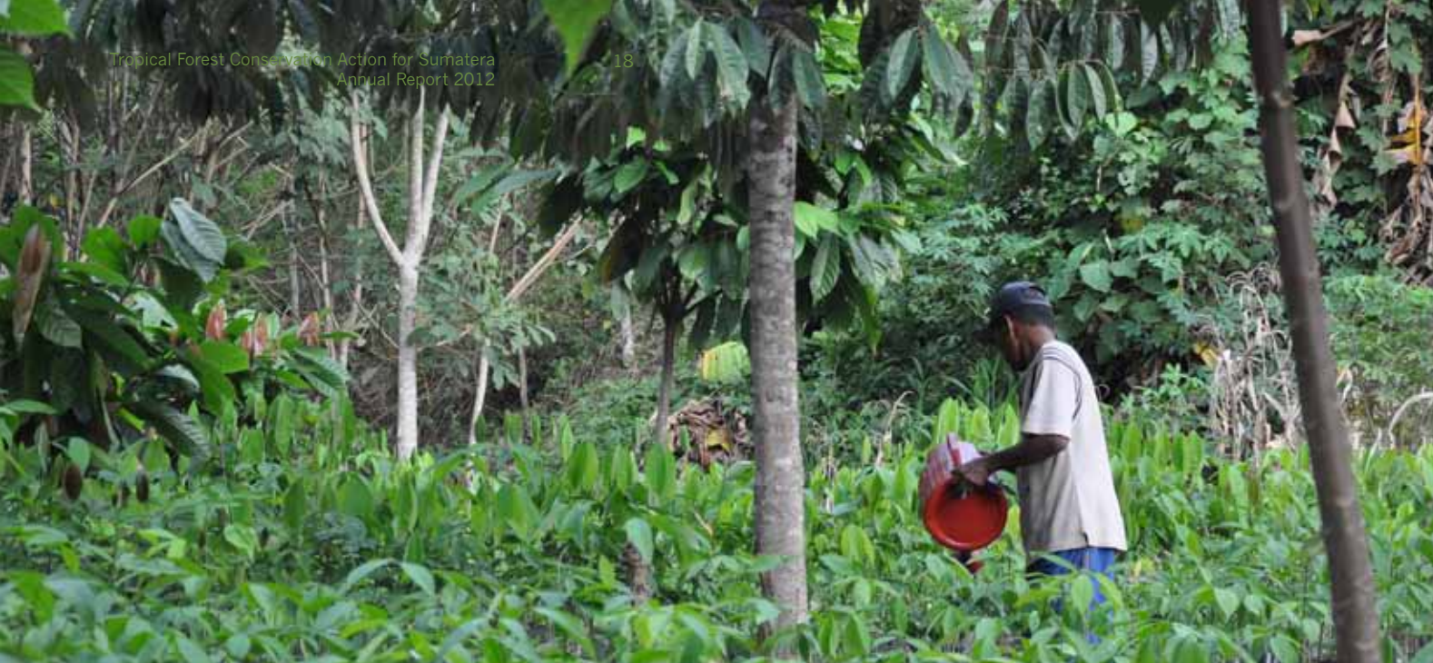
A farmer were irrigating nursery for forest restoration projects in Batangtoru forest