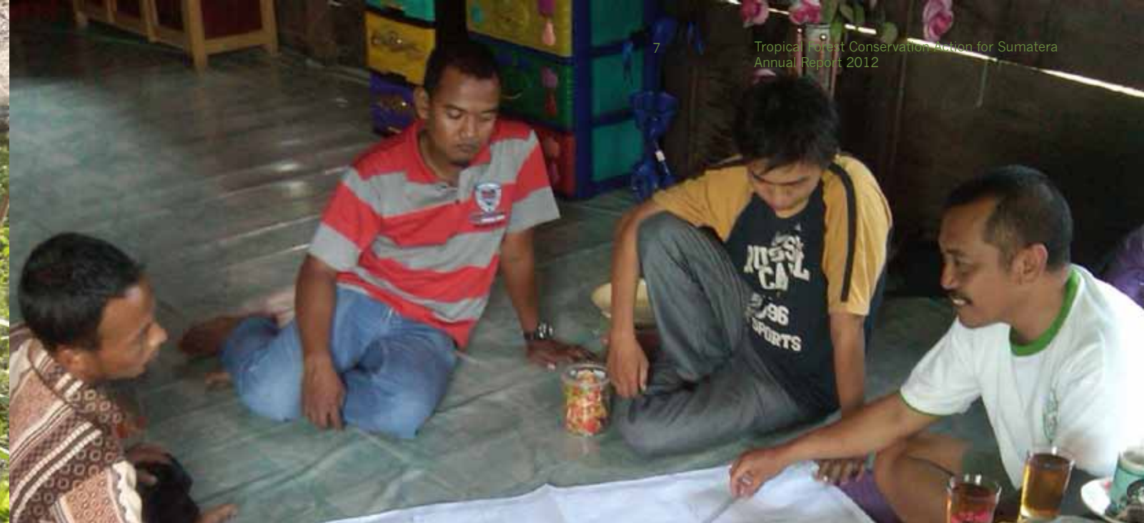
Discussions with community always maintained in order to share information and find solutions for program implementation