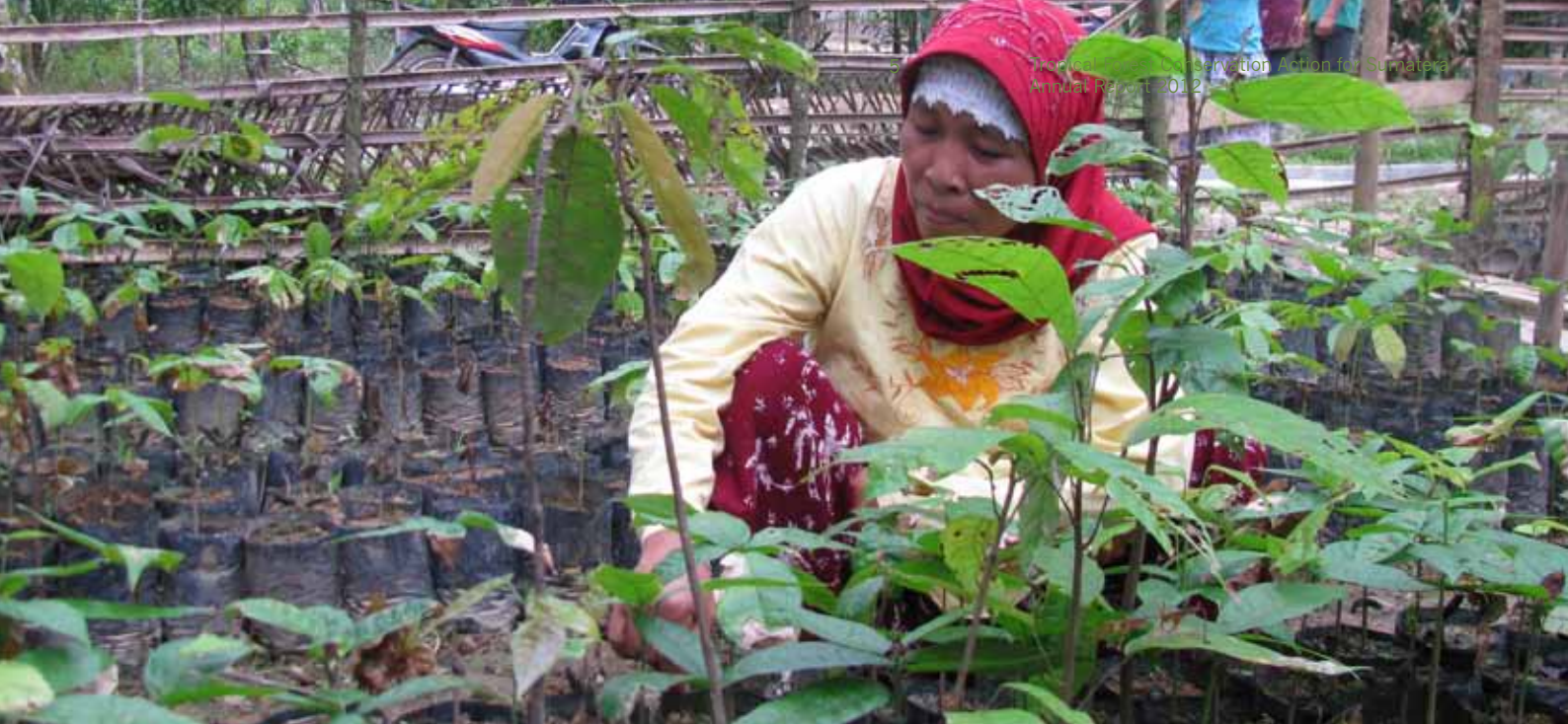
A member of cacao community groups assisted by SRI-OIC in Langkat, North Sumatra is working to arrange nursery plantation