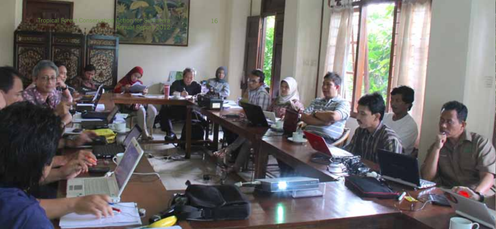
Trainings and shared learning are part of capacity building activities provided by Administrator to grantees