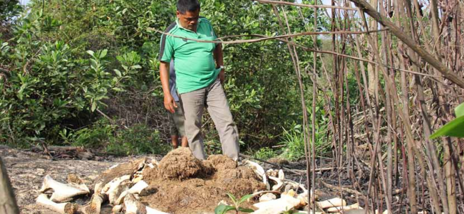
Remnants of dead elephant bones found in Tesso Nilo National Park