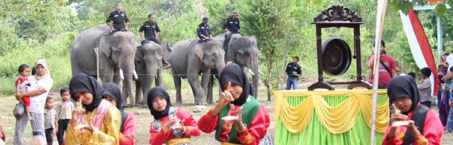
A group of local students performing traditional dance during Conservation Response Unit inauguration in Singkil-Trumon, June 28, 2012