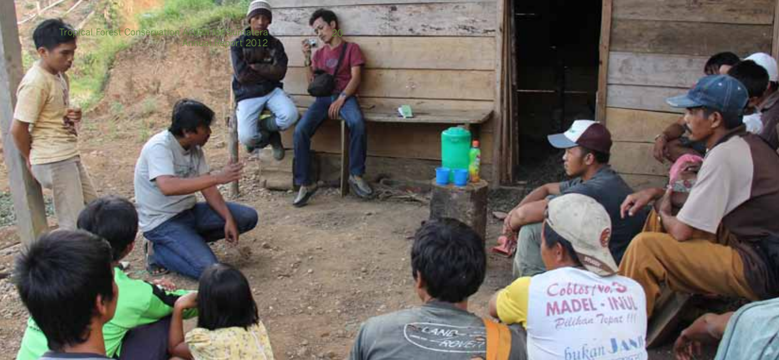
KKI-Warsi staff are providing counseling and assistance to community groups