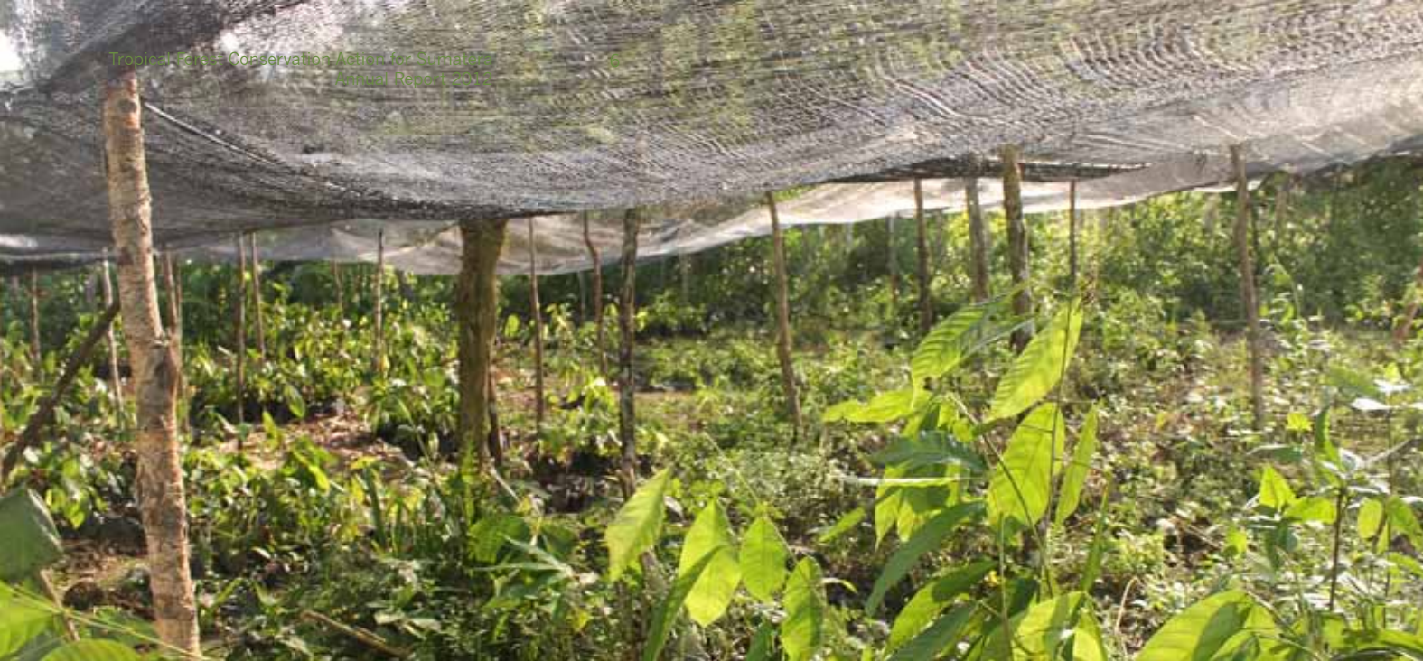
A nursery facility in Linge Isaq, Central Aceh