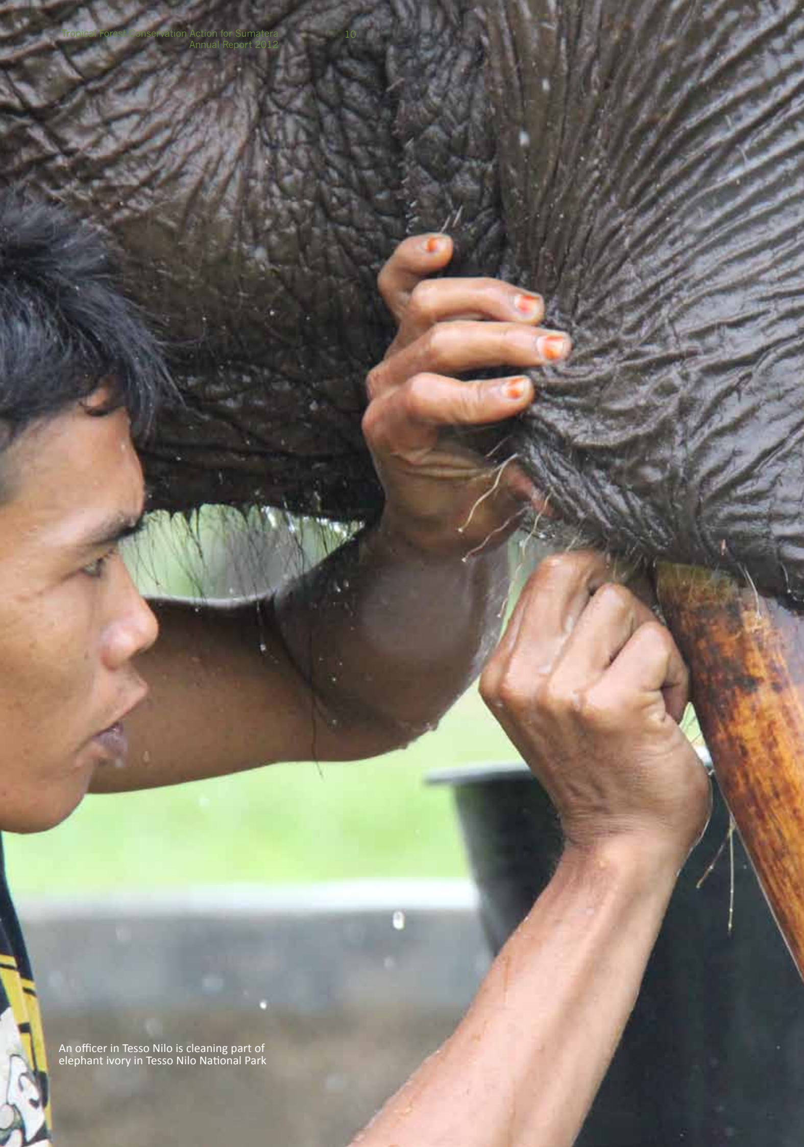
An officer in Tesso Nilo is cleaning part of elephant ivory in Tesso Nilo National Park